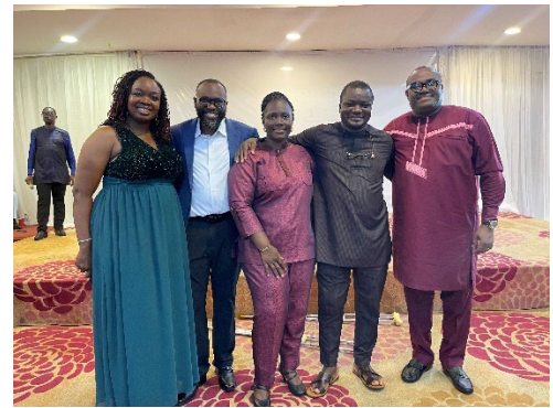
GMA Executive Board Members