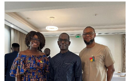
With Mr. Patrick Awuah, Ashesi University President